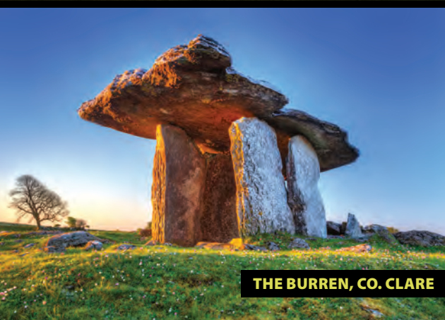
THE BURREN, CO. CLARE