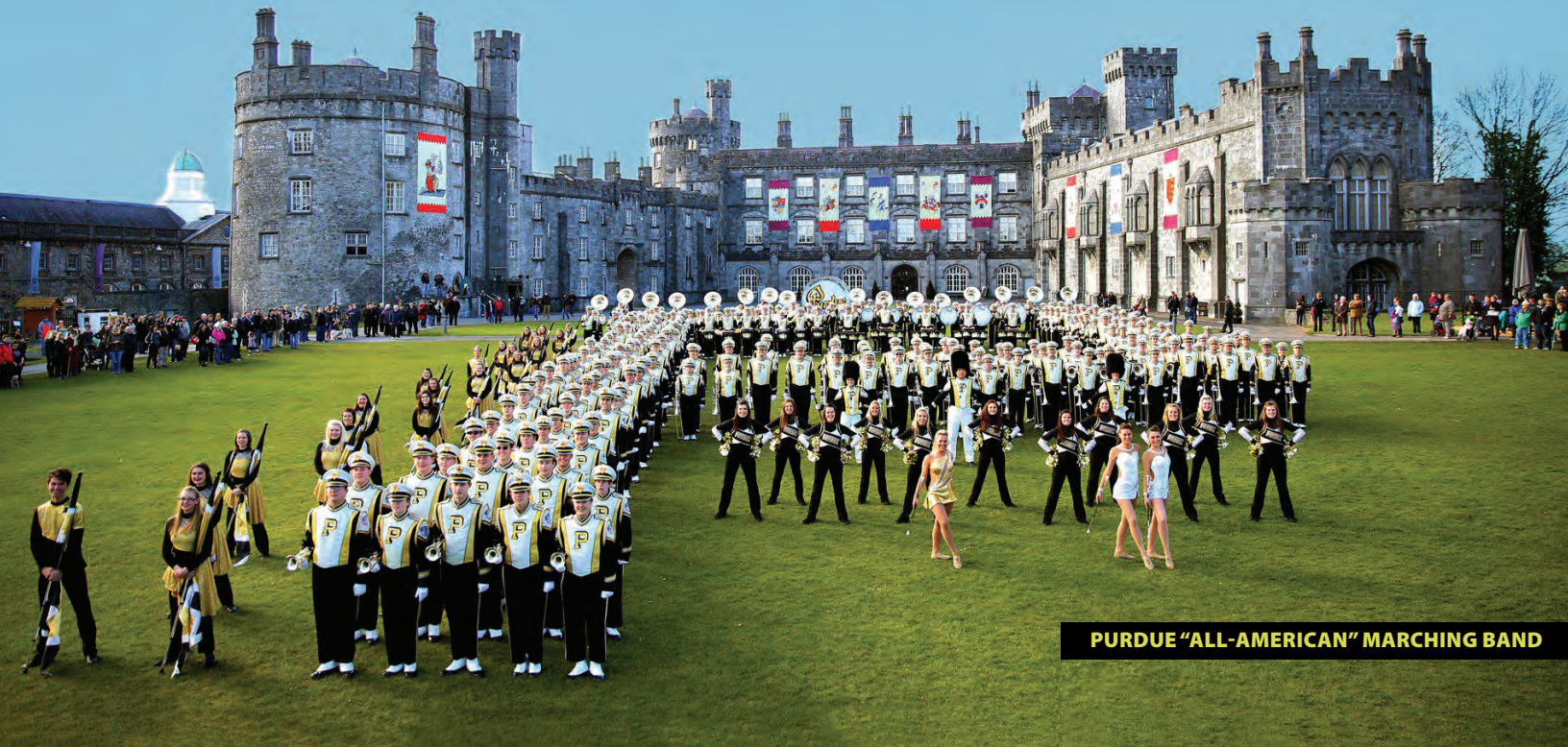
PURDUE "ALL-AMERICAN" MARCHING BAND

Stay at the luxury castle resort Adare Manor in Limerick and let the Emerald Isle sweep you away with its rugged scenery, elaborate castles, charming small towns, and spirited history. Experience legendary Dublin in style from The Shelbourne Hotel!