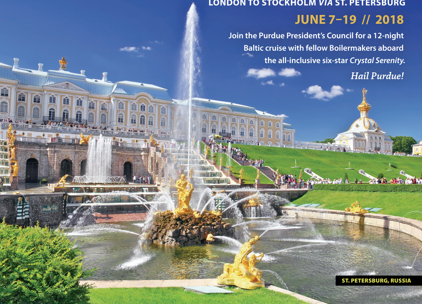
ST. PETERSBURG, RUSSIA