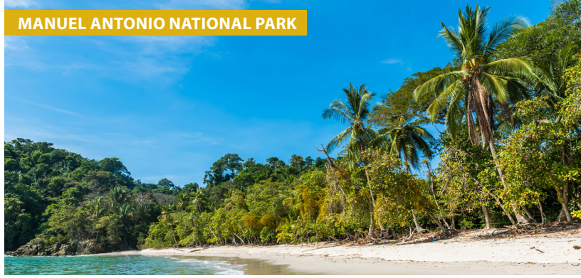
MANUEL ANTONIO NATIONAL PARK