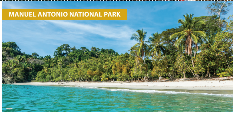
MANUEL ANTONIO NATIONAL PARK