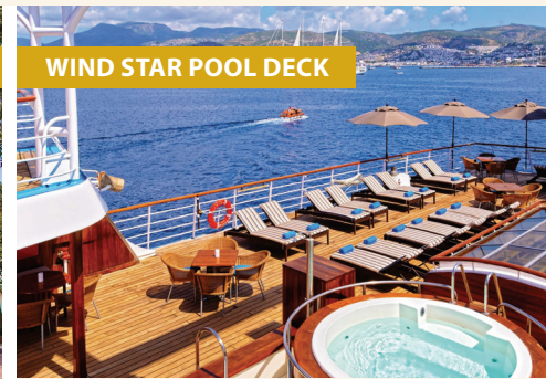
WIND STAR POOL DECK