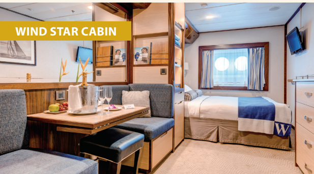
WIND STAR CABIN