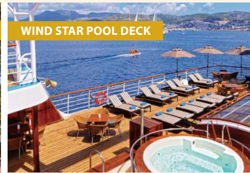
WIND STAR POOL DECK