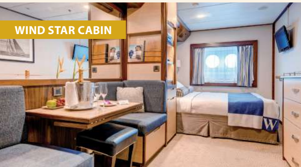
WIND STAR CABIN