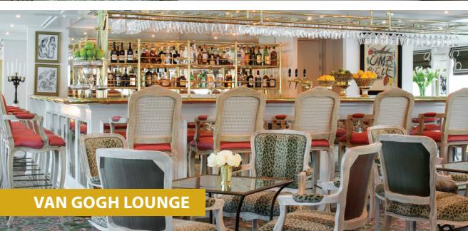
VAN GOGH LOUNGE