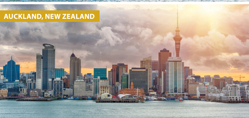
AUCKLAND, NEW ZEALAND