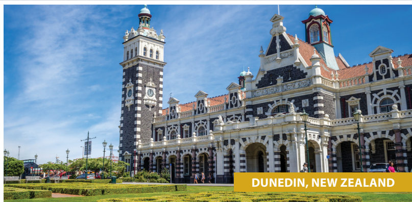
DUNEDIN, NEW ZEALAND