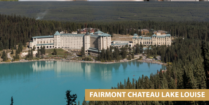
FAIRMONT CHATEAU LAKE LOUISE