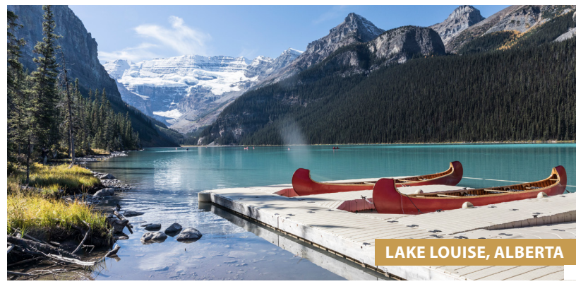
LAKE LOUISE, ALBERTA