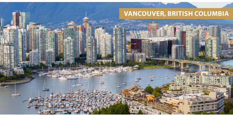
VANCOUVER, BRITISH COLUMBIA