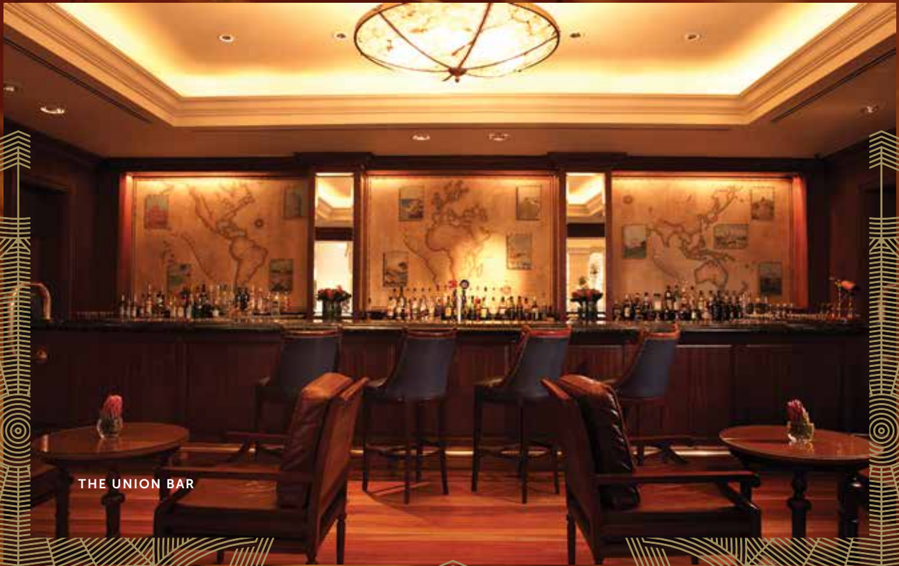
THE UNION BAR

The Union Bar is classy with sea-faring and shipping memorabilia dotting the plush, wood-panelled walls. This is where guests can sip fine wines and premium whiskies from leather armchairs. If fine living gets too much, there's always a wide selection of well-poured cocktails to enjoy.