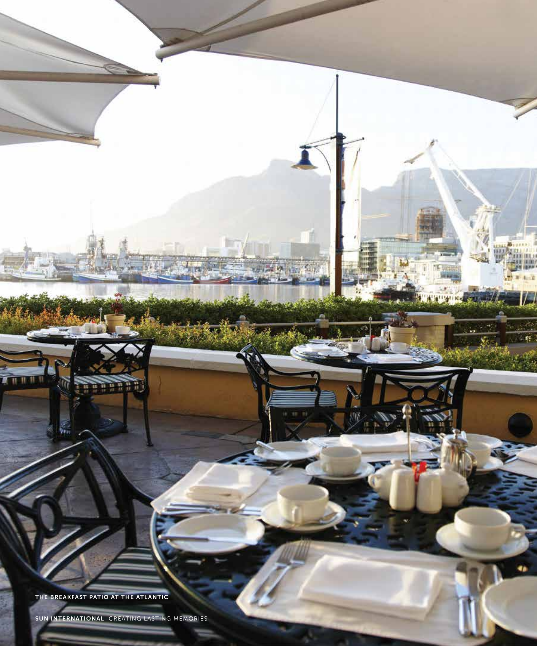
THE BREAKFAST PATIO AT THE ATLANTIC

SUN INTERNATIONAL CREATING LASTING MEMORIES