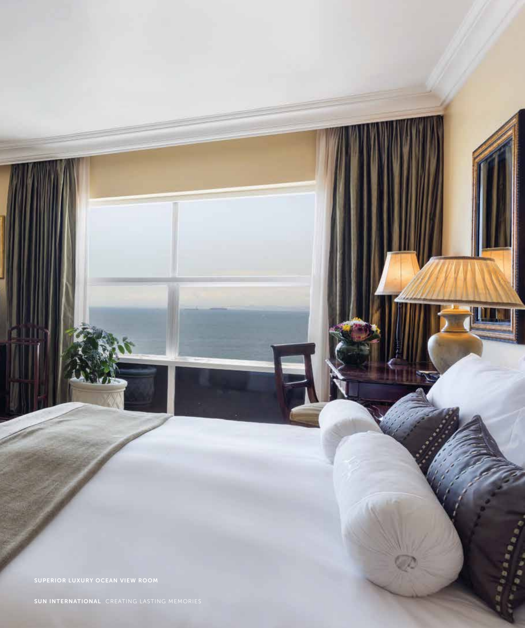
SUPERIOR LUXURY OCEAN VIEW ROOM