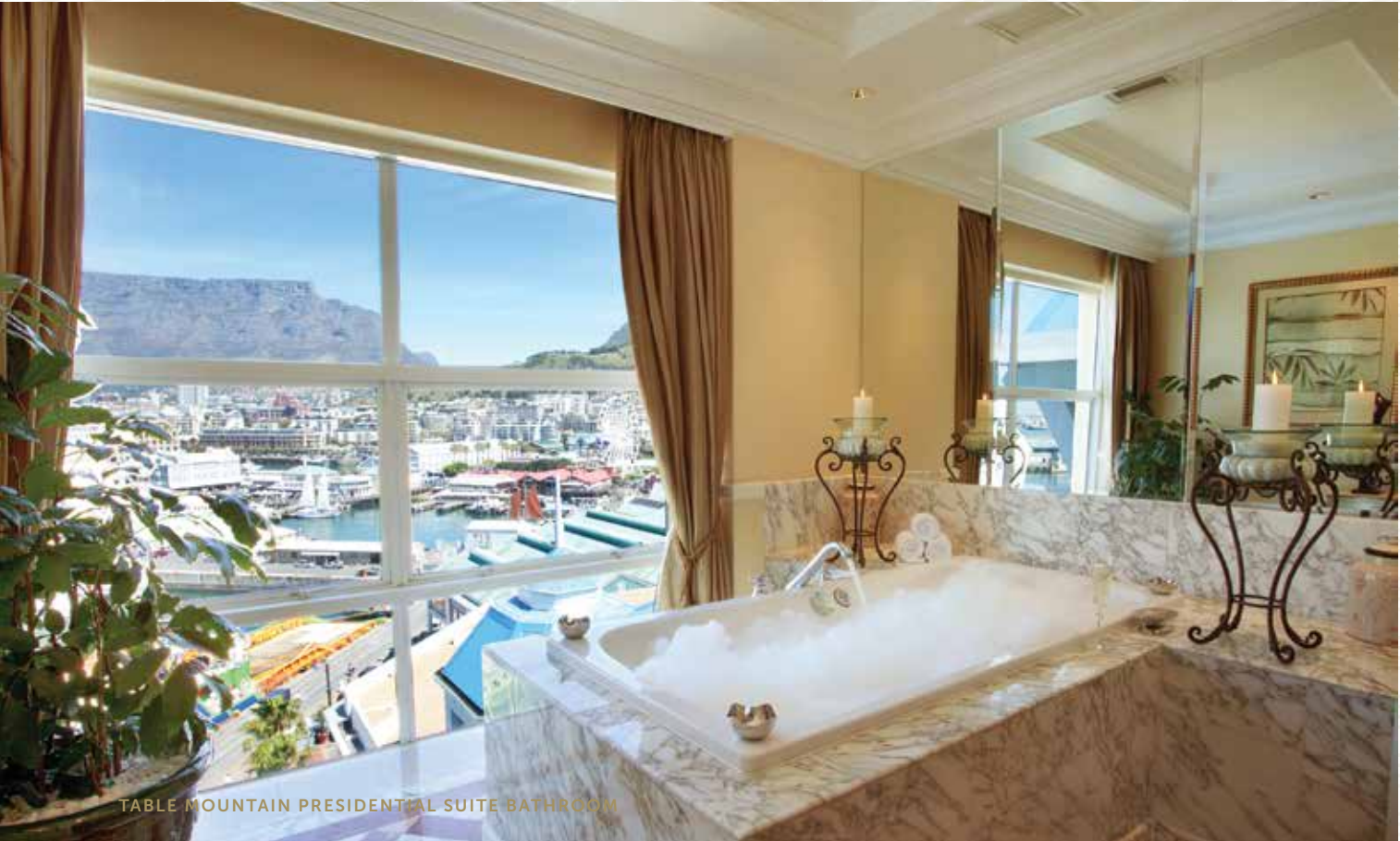
TABLE MOUNTAIN PRESIDENTIAL SUITE BATHROOM