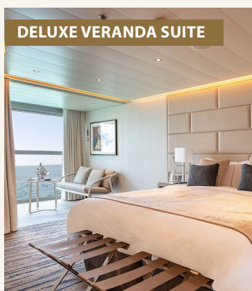
DELUXE VERANDA SUITE