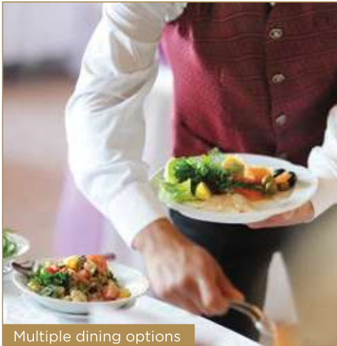
Multiple dining options

The extraordinary AmaMagna is redefining the river cruise experience while sailing on the Danube River. Experience the ultimate in luxury, whether you're exercising in the expansive Zen Wellness Studio or enjoying the views from the full balcony in your stylish suite. With five bars, four unique restaurants – including the new AI Fresco restaurant and Jimmy's, a warm family-style venue – a heated sun-deck pool and whirlpool, the AmaMagna has quickly become the most luxurious cruise ship on the river.