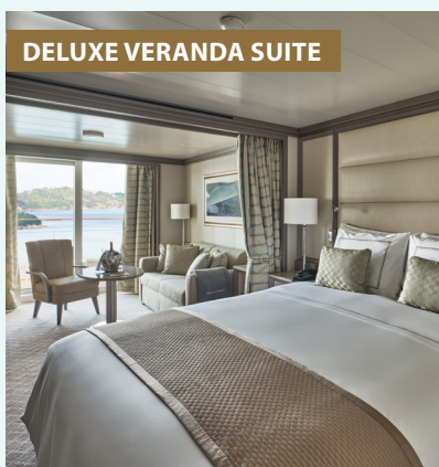
DELUXE VERANDA SUITE

Your travel-package registration fee includes support for ongoing adventures, events, and lifelong educational opportunities with the President's Council family. As a part of your overall price, a $500-per-person, tax-deductible donation to the President's Council Enrichment Fund helps underwrite the involvement of Purdue educators and administrators to enhance your personal travel experiences—a benefit exclusive to Purdue President's Council members.