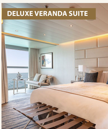
DELUXE VERANDA SUITE